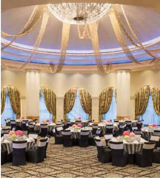
Event Venues, on Level II and Ground Floor

Enjoy access to exclusive planner tools like custom event websites, simple contracts, e-Billing and more. Plus, a dedicated sales team and great offers at some of the world's most distinctive hotels and resorts make it an easy business decision.